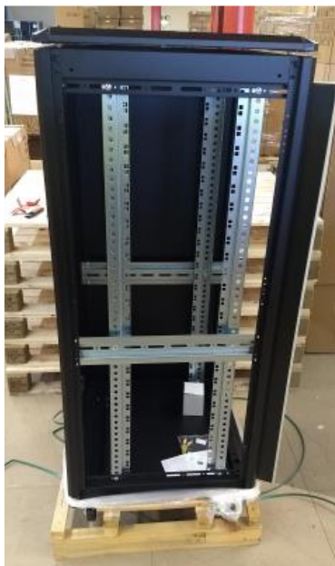
Side Panel removed.

Picture showing mounting strip/equipment access from side panel