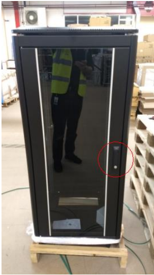
Front view of cabinet when unpacked. Access via front door handle, (red circle).

Example cabinet: 12-2110 CANFORD ES3626626/B-L RACK CABINET 26U, 600w, 600d, black