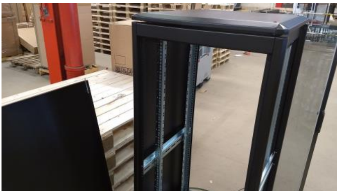
Back panel removed from cabinet.