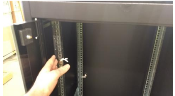
View showing side panel. Use keys on lock, (red circle).

Keys to lock/unlock front door, side panels and back panel located within. Example here shows access to equipment rack strips with keys tied to such – see right.