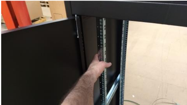
Picture showing access to rack strips/equipment with back panel open.

To further aid access back panel can be removed from rack. Top hinge is sprung, pull down to release back panel and lift from the bottom hinge pin.